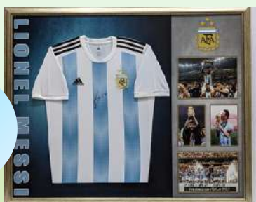
Messi Argentina #10