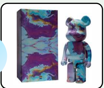
BE@RBRICK MARBLE 1000%