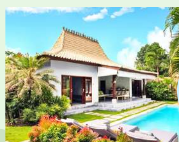
Private Bali Escape 7 Nights for 6 Pax