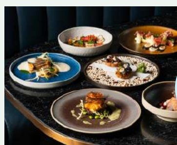
Chef's Tasting Menu at VUE for 2 pax