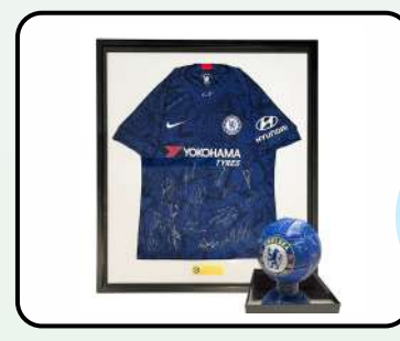
Signed Jersey & Ball by Members of Chelsea FC Squad (Season 2019-2020)