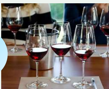
Introduction to French Wine Masterclass for 2 pax